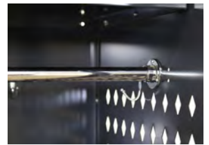
Optional Hanger Bar