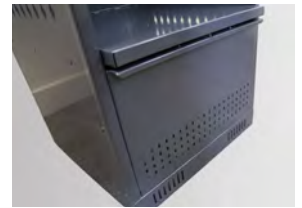
Optional Lockable Storage Bin

GSS Lockers designs and builds the highest quality lockers available in the market. That's why we use the strongest steel for our Varsity Lockers and components. Available in a range of several colour powder-coated finishes. Lockers may be purchased fully assembled, knocked-down, or with fully-welded bodies.