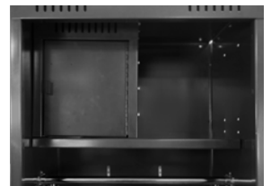
Optional Compact Lock Box