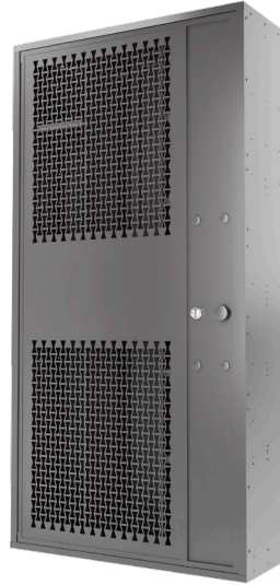
Back - Pass-through