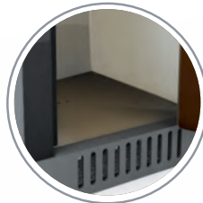
No rust bottoms