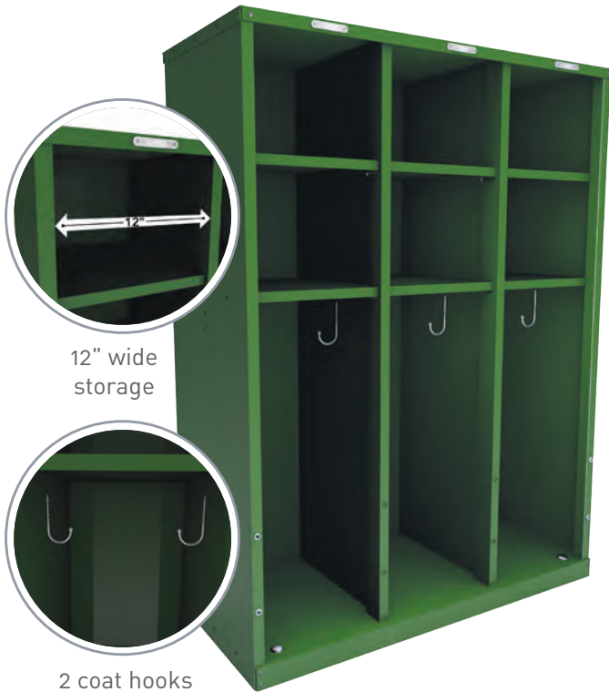
12" wide storage