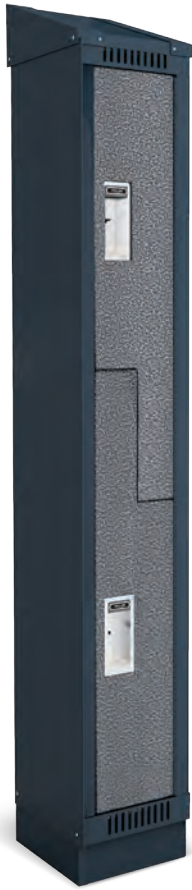
Pro Line Z Locker