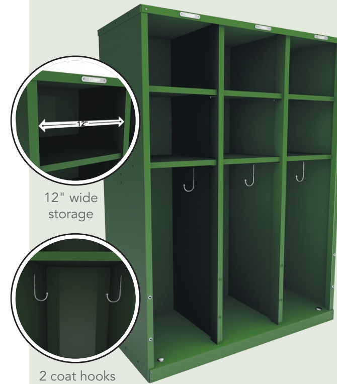
12" wide storage